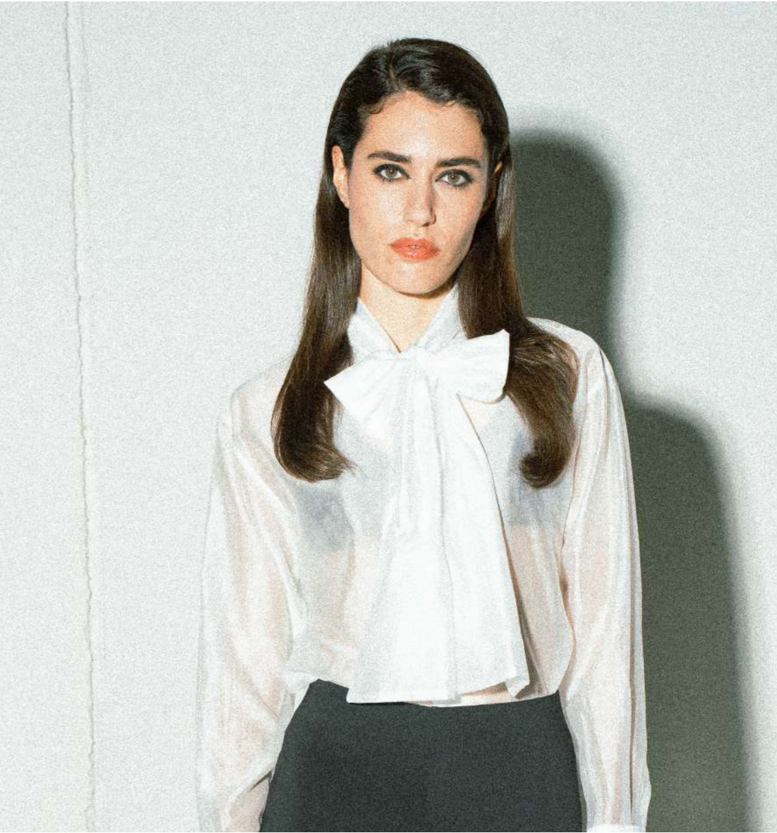
bow-shirt CODE 509