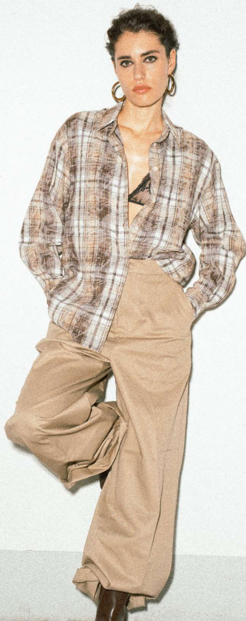
check-shirt CODE 543