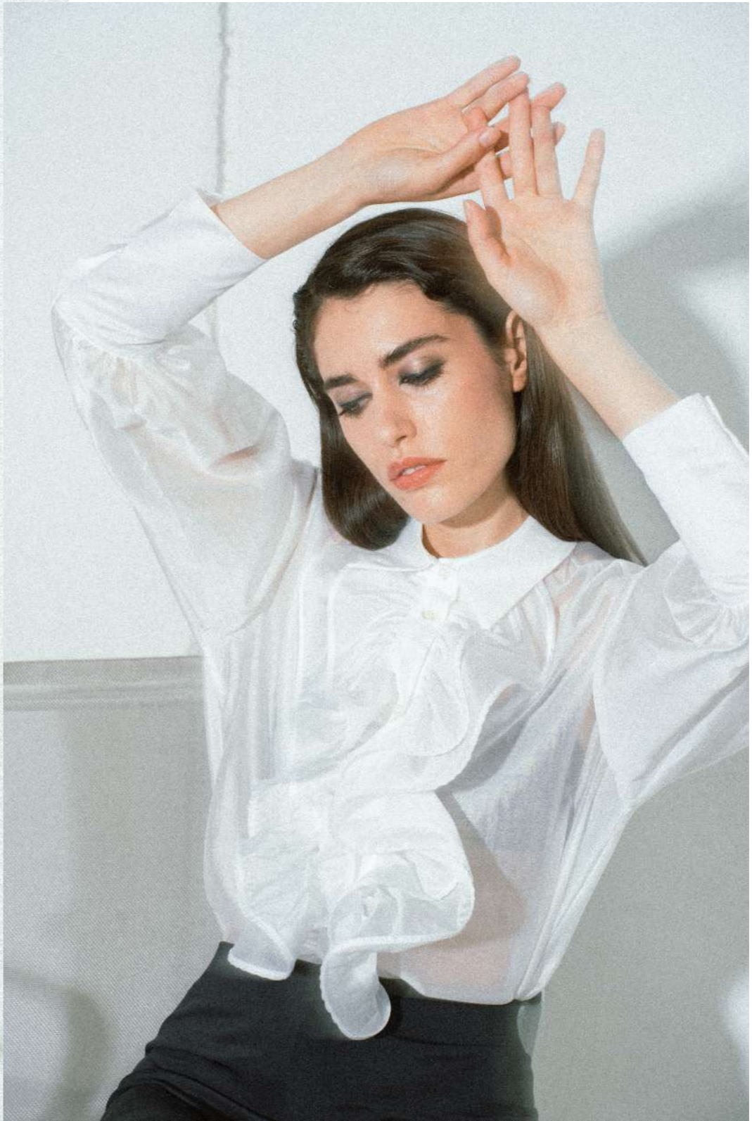
ruffled-shirt CODE 507