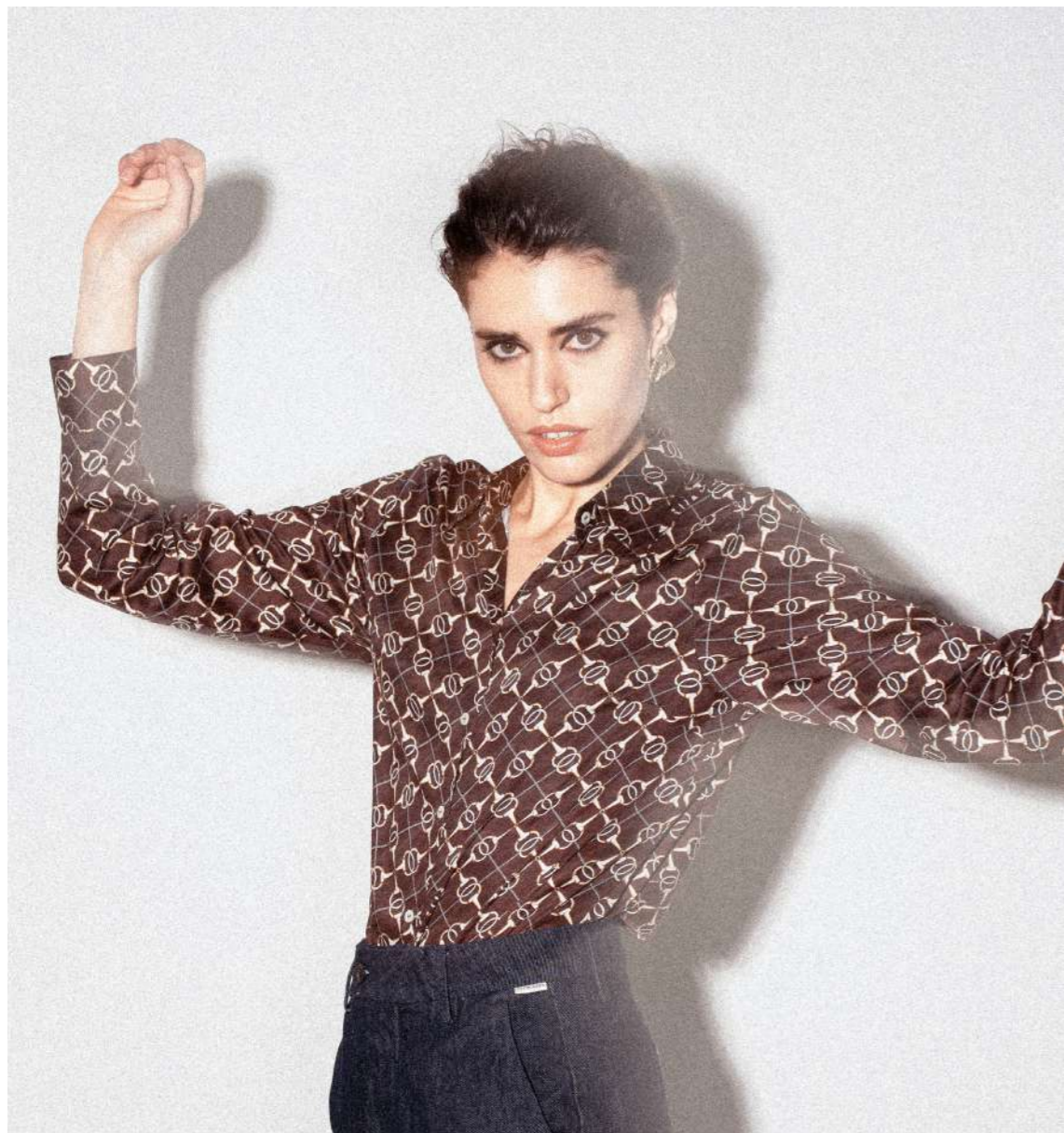
pattern-shirt CODE 525