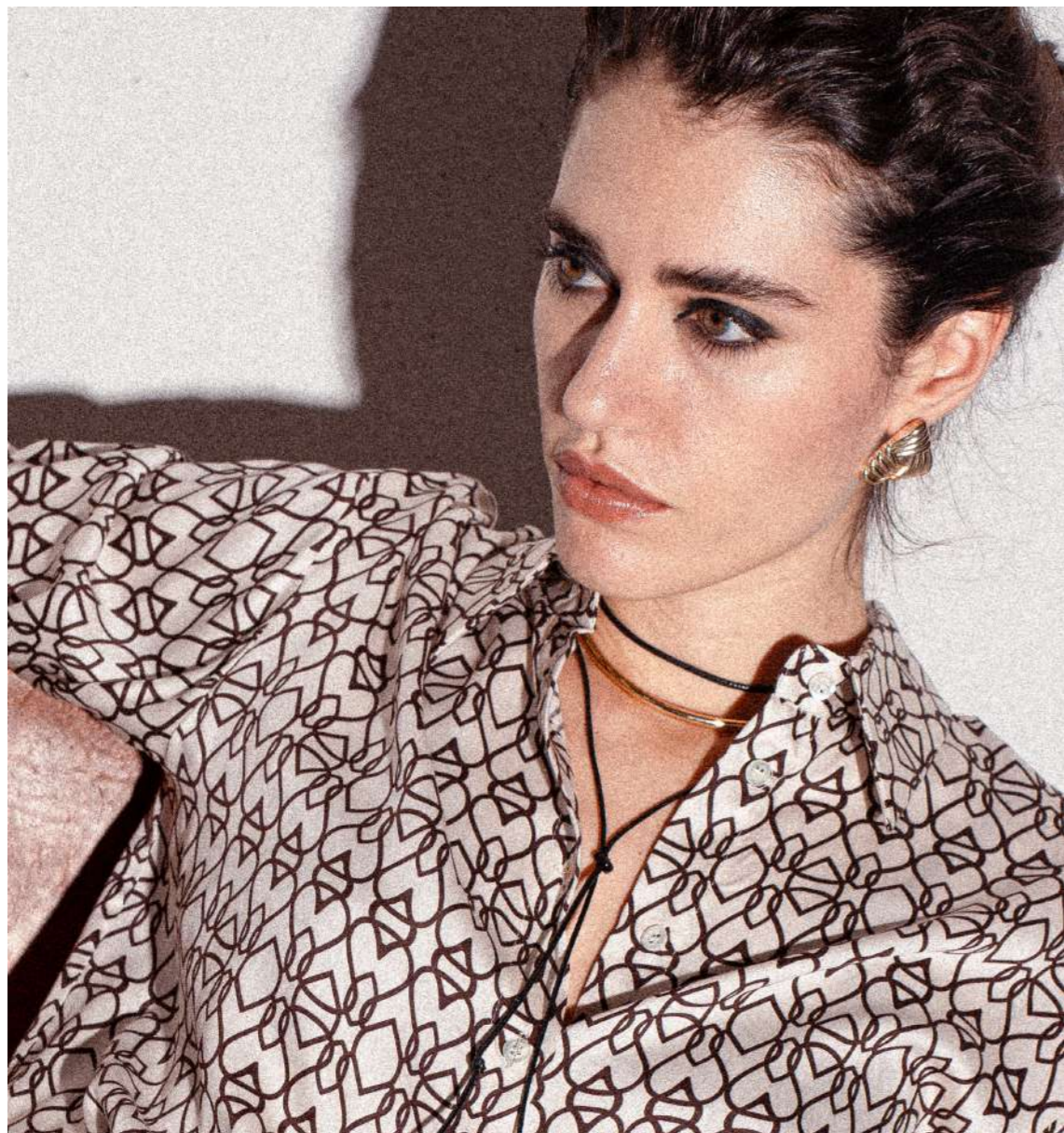
patterned-shirt CODE 531