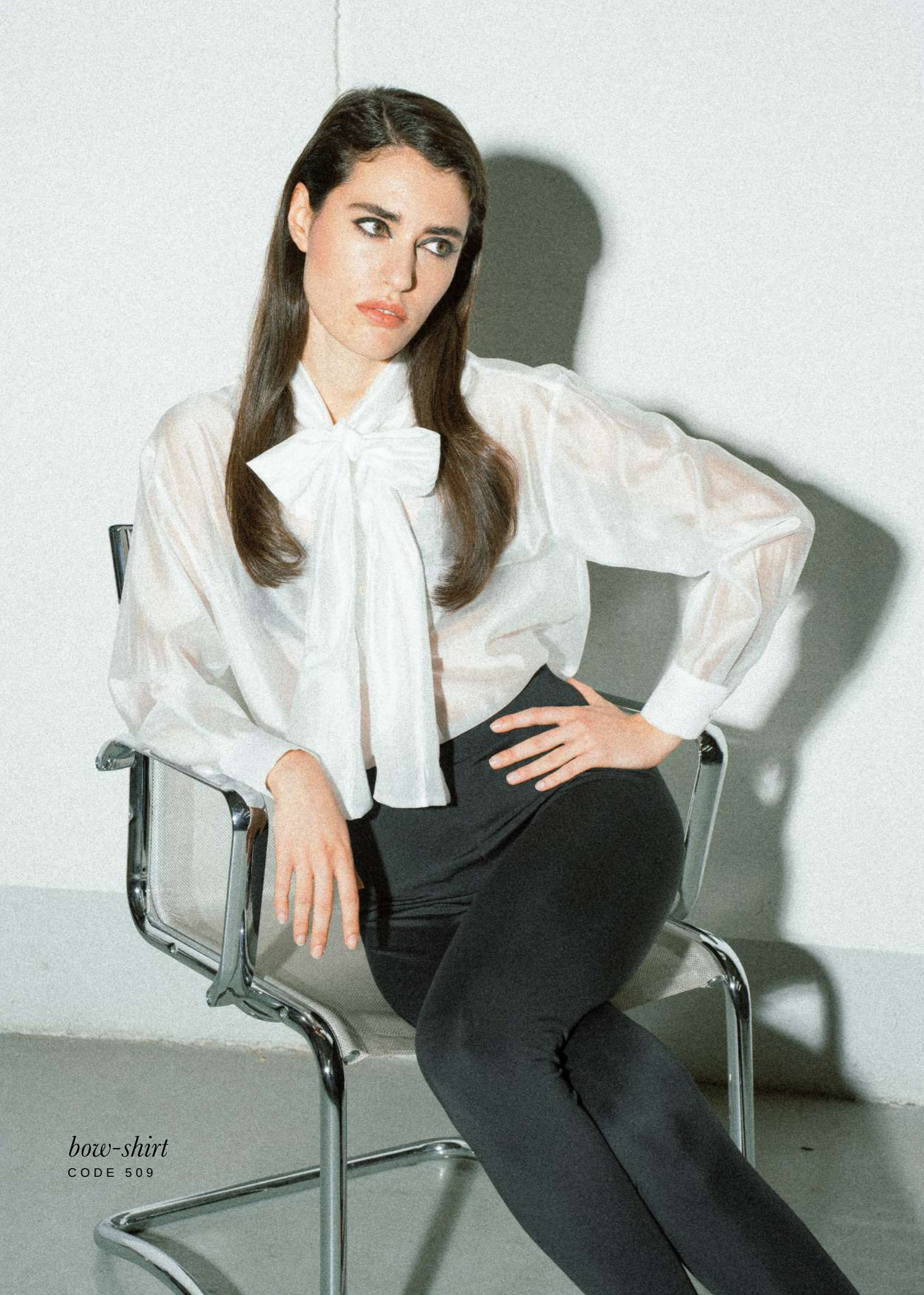
bow-shirt CODE 509