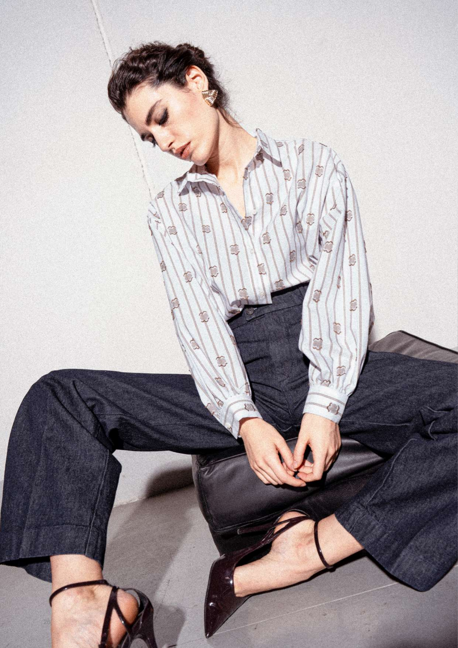
pattern-shirt CODE 511