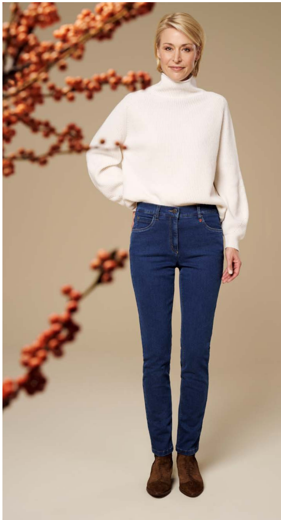
My Style Art. 12-02 Mod. 2700 Fb. 57