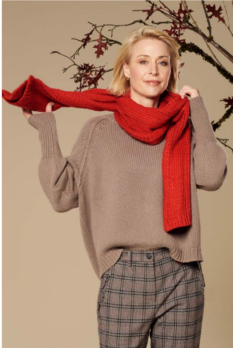
Meine beste Freundin Zip / My Best Friend Zip Art. 44-01 Mod. 284217 Fb. 58